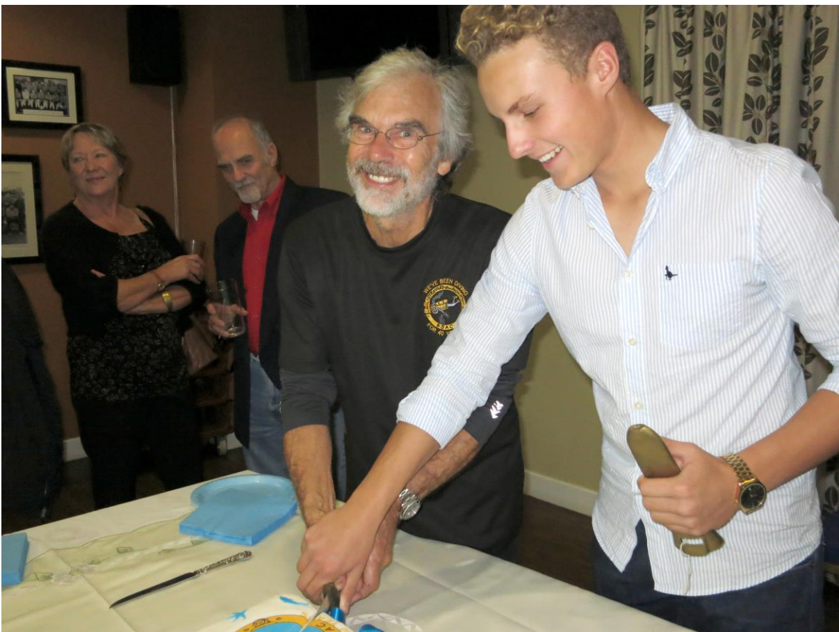
The Longest Serving and The Youngest Qualified Diver