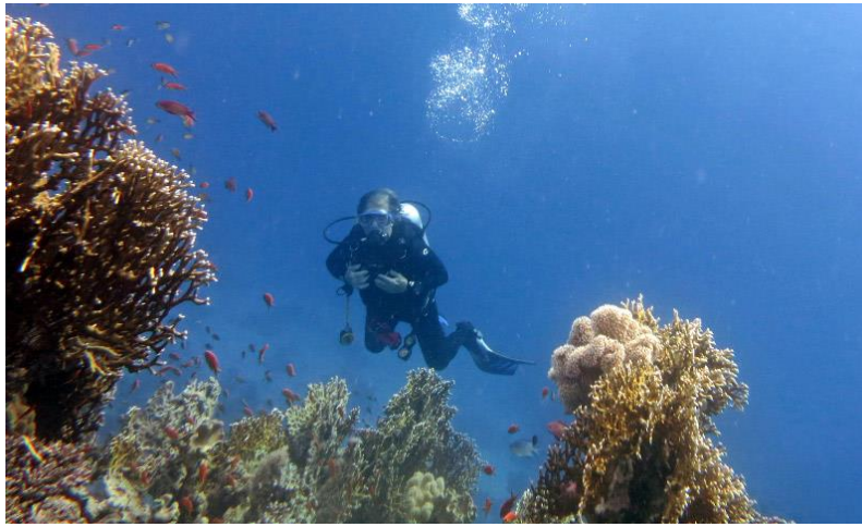
People under Water - Dai