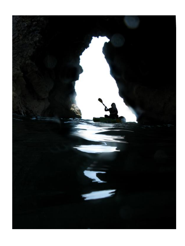
Above Water - Keith