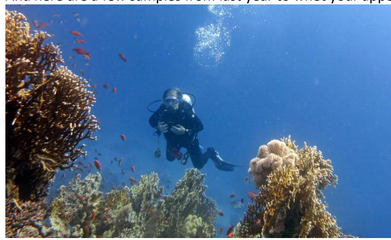
People under Water -

And here are a few samples from last year to whet your appetite: