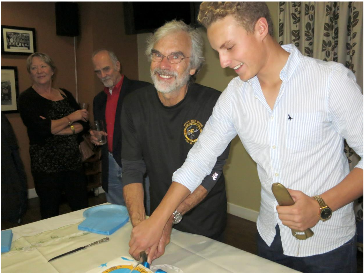
The Longest Serving and The Youngest Qualified Diver