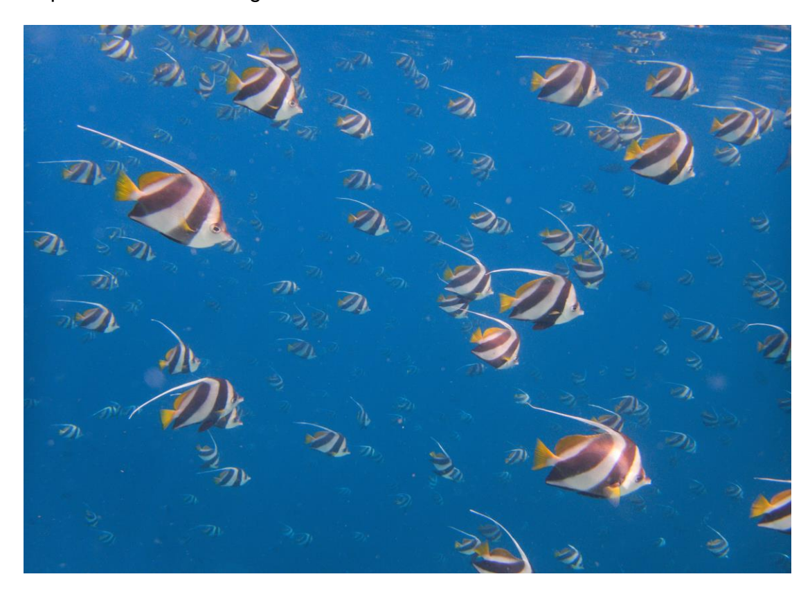
Graham Greener- Specimen Fish