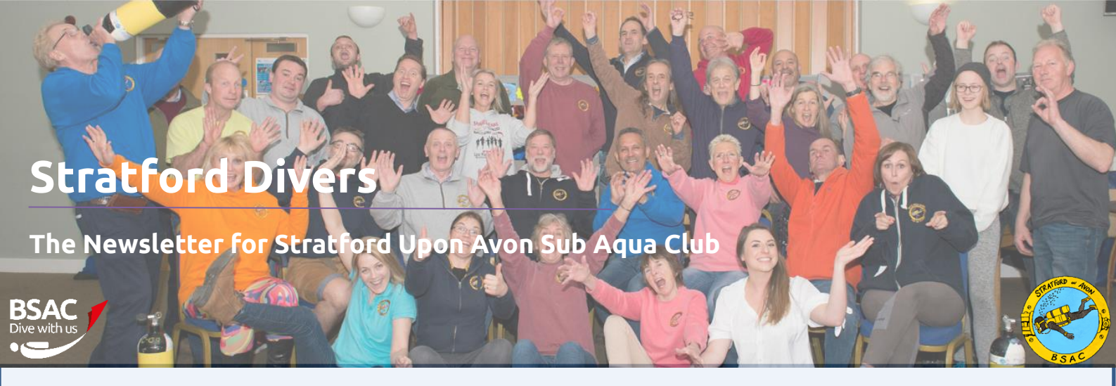
Issue 25 | March 2022